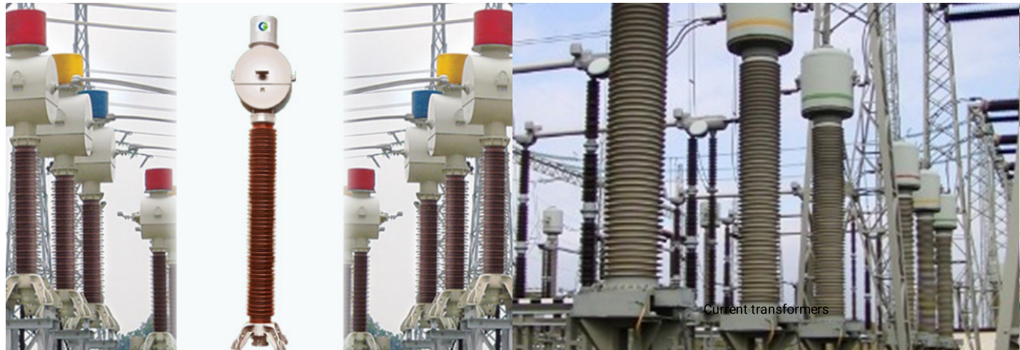
INSTRUMENT TRANSFORMERS AND BUSHINGS

HOME (HTTPS://WWW.CGGLOBAL.COM/) > POWER (HTTPS://WWW.CGGLOBAL.COM/OUR_BUSINESS/POWER) > SURGE ARRESTORS (HTTPS://WWW.CGGLOBAL.COM/OUR_BUSINESS/POWER/SURGE-ARRESTORS) > INSTRUMENT TRANSFORMERS AND BUSHINGS (HTTPS://WWW.CGGLOBAL.COM/OUR_BUSINESS/POWER/SURGE-ARRESTORS/INSTRUMENT-TRANSFORMERS-AND-BUSHINGS) > CURRENT TRANSFORMER UP TO 800 KV